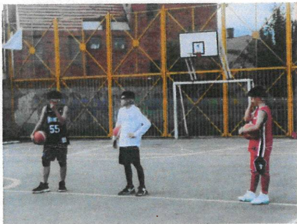
My son on his basketball training

all, so I wanted to spend time with him (sports are good to do this) at the beginning he used to reject my invitations, but finally he gave it a try, the thing is now