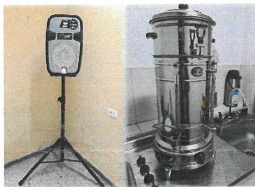
Portable speaker and Coffee Machine

which is very useful for the preaching of the Word (indoor and outdoor) and the other is a coffee machine (capacity 120 cups), which will help to improve the fellowship and friendship among the members after services